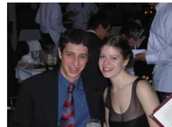
Formal at the Gatehouse