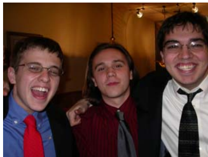
The newly initiated Mu Pledge Class