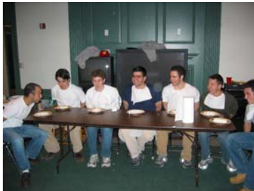
Gluttonous pledges and brothers