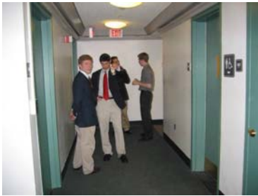
Dude, where's my car?